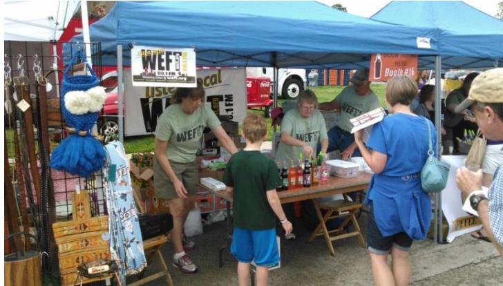
WEFT volunteers were at the Homer Soda Festival, Saturday May 30 th this year dispensing “gourmet” sodas while informing festival attendees about our radio station.